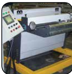
| Simple Blanker with PLC