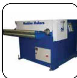
| Stand Alone Blanker