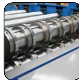
| Optional Slitting Head