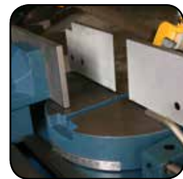
| Heavy Duty Vice