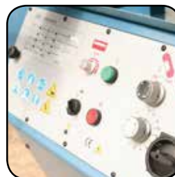
| Front Mounted Control