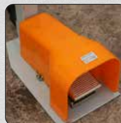
• Covered Foot Pedal