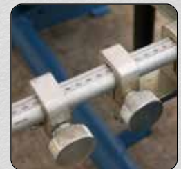
• Calibrated Sheet Supports