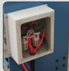
• Covered Gauges for Safety